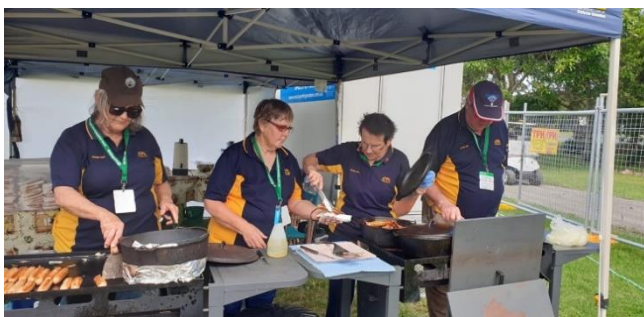
The crew hard at work at Mackay Home Show Sausage Sizzle

Next came the Home Show sausage sizzle, and while you are walking around checking out the latest new caravan, bed or tools it creates a hunger and then you are ready to grab a drink and a sausage from the girls. It always goes down a treat and over three days we go through a lot of sausages. I mean a LOT. No rest for the wicked! LOL